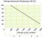
At 50% discharge range, 120 (times) cycles/charge At 10% discharge range, 150 (times) cycles/charge