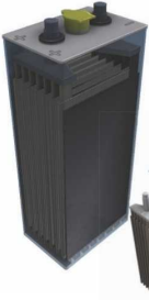
Laboratory Characteristics Electrolyte Temperature 15°C Charge Amount Discharge 0,120

The best values for the battery electrolit's density have to be when fully charged at 28 C ± 1,2gr/cm 3 , end of discharge 1,11 – 1,14gr/cm 3 . Please do not let discharge value less than 1,05, to increase battery life time.